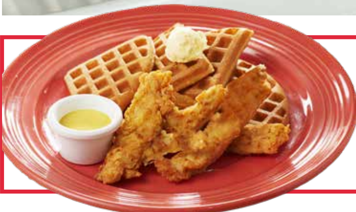
FRIED CHICKEN & WAFFLE 445