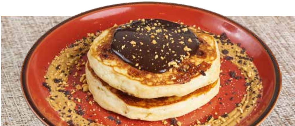
CHOCO OVERLOADED PEANUT BUTTER PANCAKE 140 / 255 Buttermilk pancakes with chocolate and white chocolate chips, hot fudge and peanut butter sauce