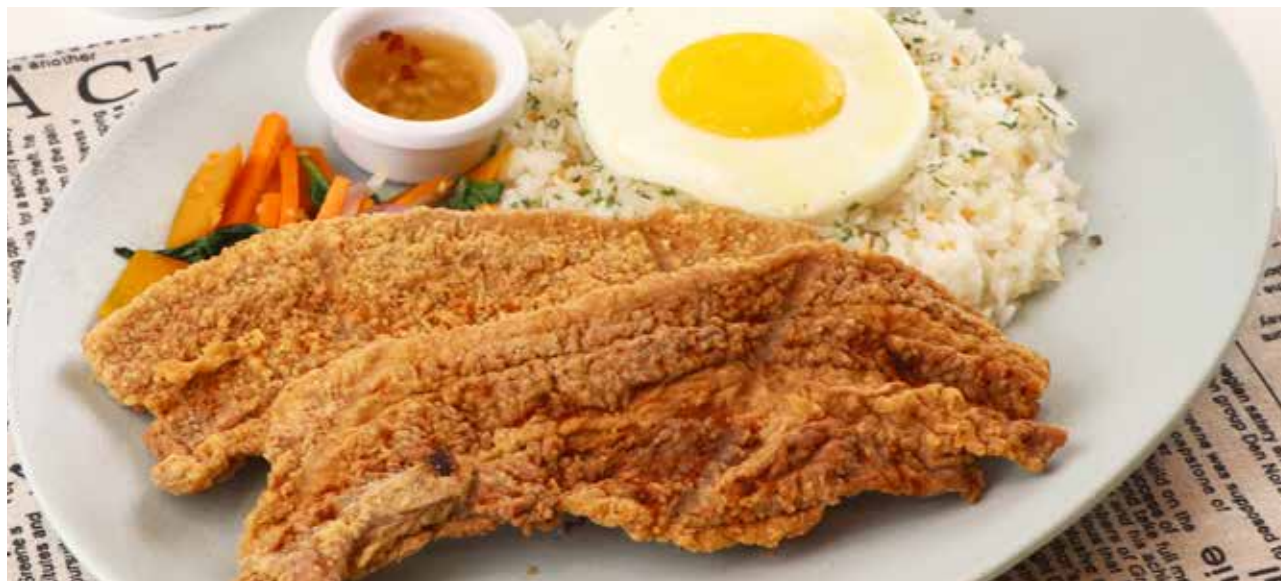
PORK BELLY CRUNCH Crispy pork belly, egg and garlic rice 495