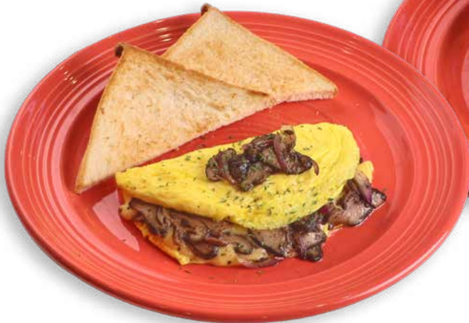
TRUFFLE MUSHROOM OMELETTE 495 Shiitake mushroom, melted cheese, truffle oil, onions.

COMES WITH A CHOICE OF TOAST OR STEAMED RICE