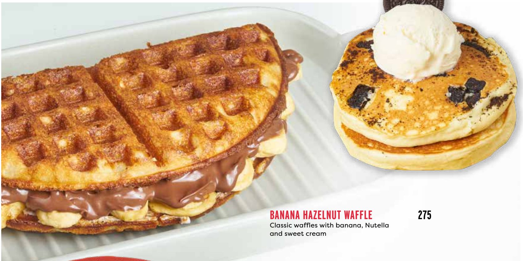
BANANA HAZELNUT WAFFLE 275 Classic waffles with banana, Nutella and sweet cream