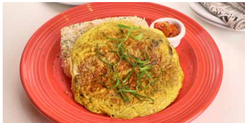
275 CLASSIC EGGPLANT OMELETTE Eggplant, leeks, served with pico de gallo