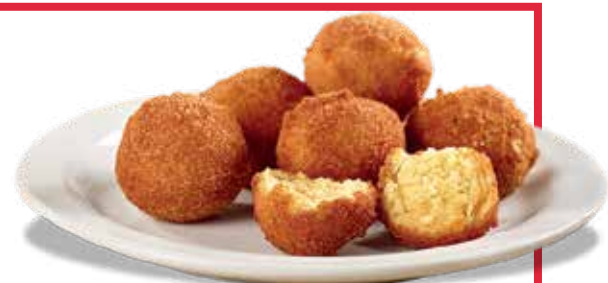
PANCAKE PUPPIES 175