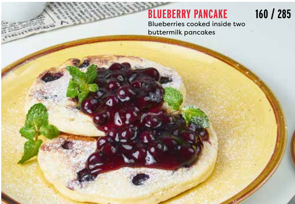
BLUEBERRY PANCAKE 160 / 285 Blueberries cooked inside two buttermilk pancakes