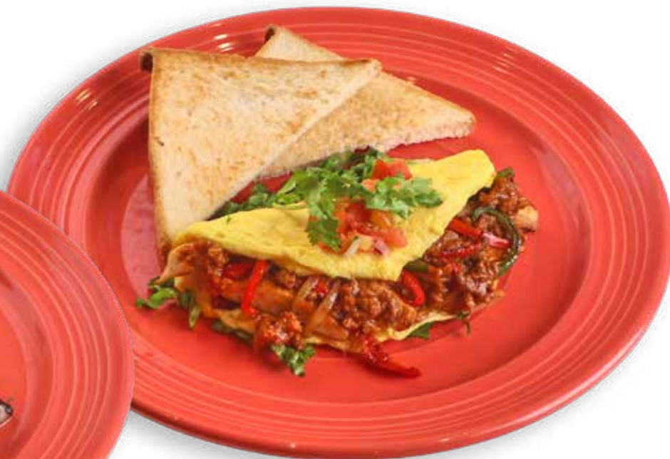
TACO OMELETTE 375 Grilled chicken breast, nacho meat, chopped Romaine lettuce, bell peppers, cilantro & onions. Served with toast.