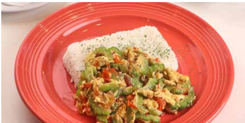
AMPALAYA OMELETTE Bitter gourd, tomatoes, onion & parsley.