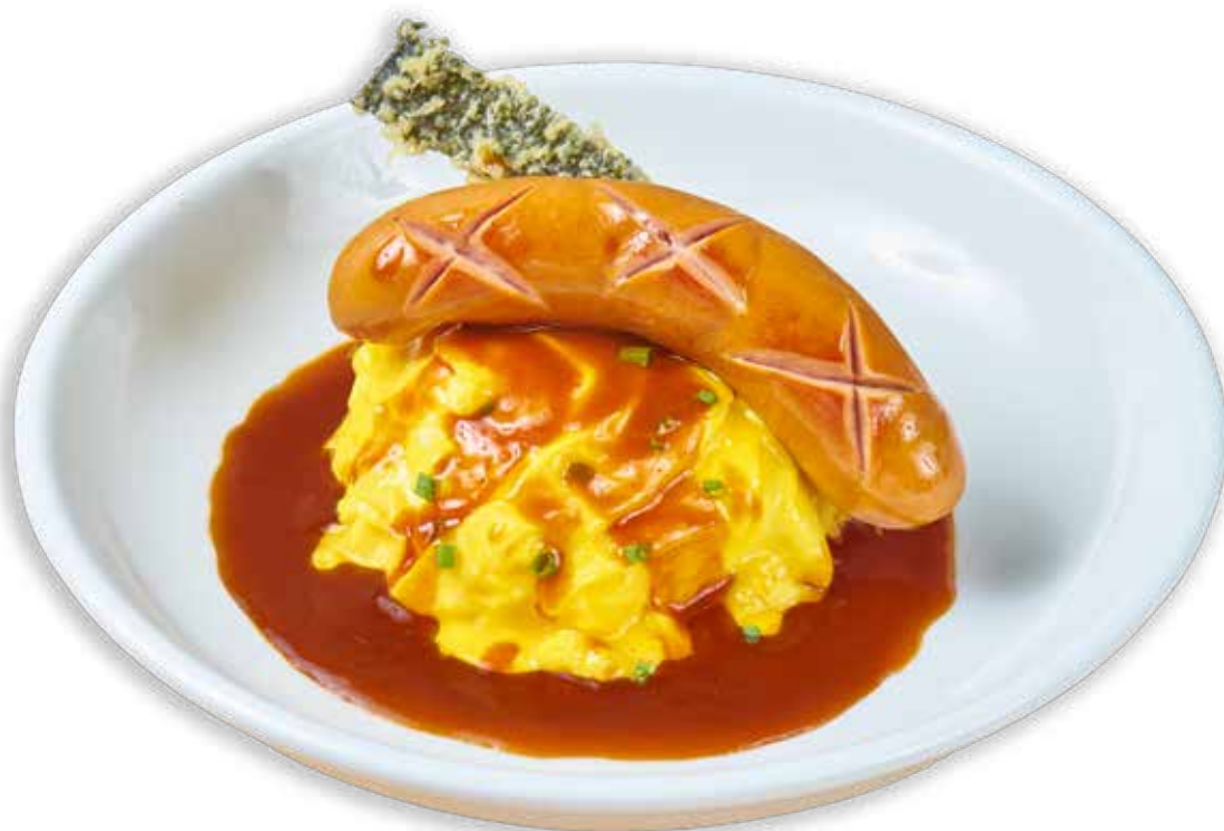
NEW! CHEESY OMELETTE 495 Choice of Spam or hungarian Sausage

OUR PRICES ARE INCLUSIVE OF 12% VAT. NO SERVICE CHARGE